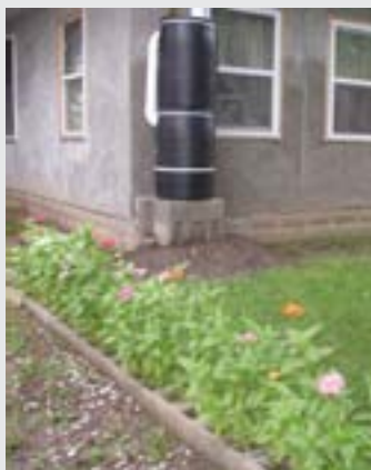
Rain water Collections System Circ. 2011

For more information about Biolutions, log onto www.biolutions.us (we are currently developing it – thank-you for your patience!) or call 618-303-0703.